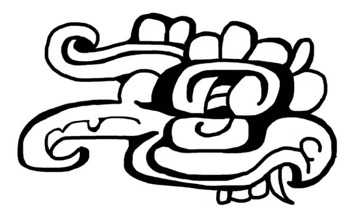
Figure 2. Imix, Mundo Perdido, Tikal. Drawing by the author after Laporte and Fialko 1995: fig. 34.