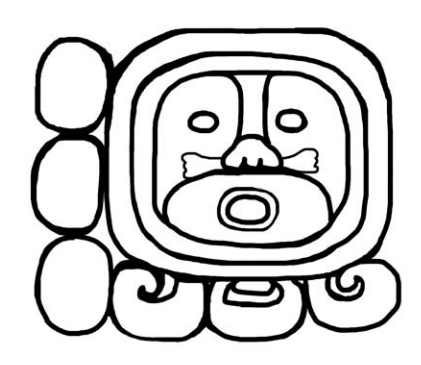
Figure 4. Ajaw , Tikal Temple IV Lintel 3, AD 746. Drawing by the author after Jones, Satterthwaite, and Coe 1982.

The relationship between the heavens and the pan-Mesoamerican rabbit day symbol is borne out in iconography related to fertility, the moon, and rabbits (see Schele & Miller 1986: 55). Kaufman (1989: 22) notes that the rabbit is also associated with ripe corn, and such agricultural fertility and productivity. Lamat plays a prominent role in certain sites, such as Naranjo, Guatemala and Yaxchilan, Mexico, whereas it is noticeably absent from other sites' inscriptions. This may signal the association of this day with certain celestial omens, for a star gushing water is the hieroglyph for the warfare event known as the "star war" (see Riese 1984; Lounsbury 1982; Martin 1996). At Naranjo, an important queen "arrives" on a Lamat day, which is suggestive of the relationship of females to the celestial iconography of this day sign (Martin & Grube 2008: 74).