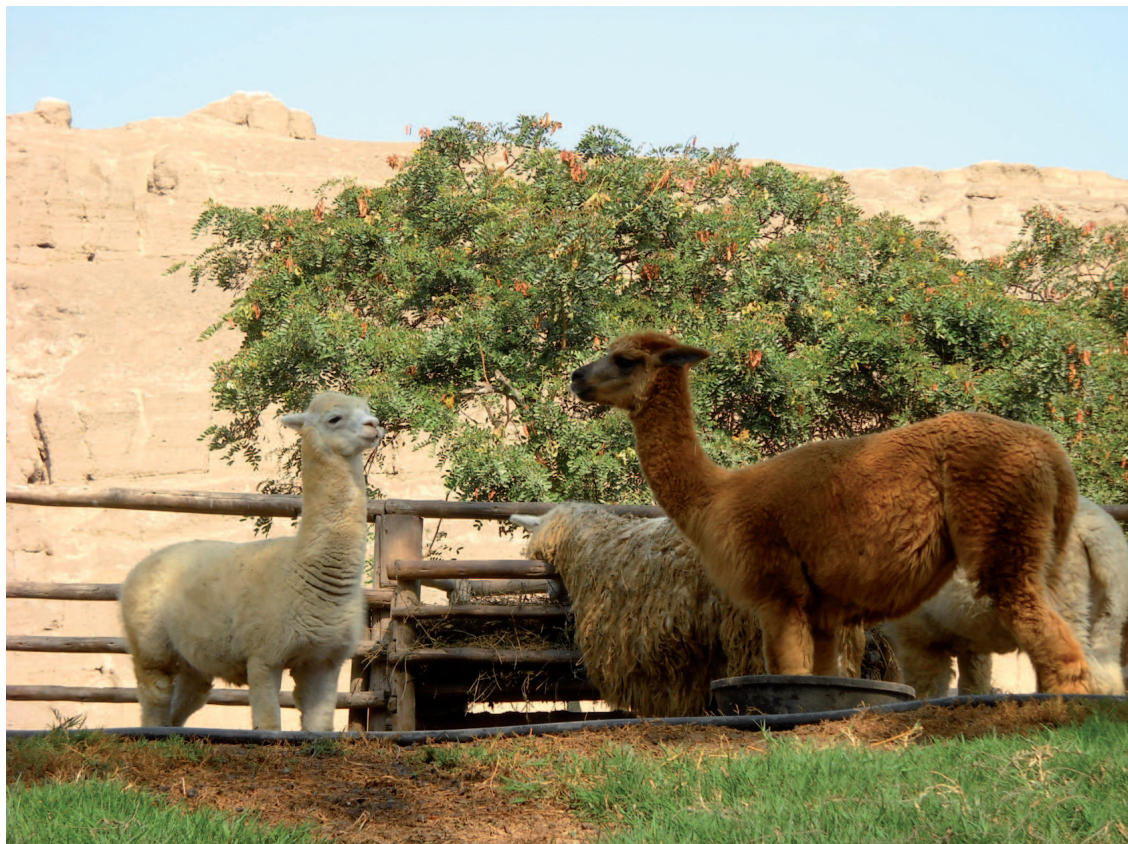
Figure 9. Andean domesticated camelids.

part of LIP, is related to contacts between highland and coastal populations in the lomas . Contacts with highland groups contributed also to the presence of llama-form pottery vessels in Chancay Black-on-White style. Written sources suggest the possibility of religious syncretism – for instance, during the so-called extirpación de idolatría in the Choque Ispana sanctuary, located in Playa Chica near Lomas de Lachay, cult chambers with statues wearing Sierra and Costa clothes were found by Spaniards (Ruiz Estrada 2006). Special attention must be given to the fact that highlanders worshipping Choque Ispana associated this deity with abundance and fecundity of their flocks (Ruiz Estrada 2006), which strongly suggests a relation to transhumance in nearby fog oases.