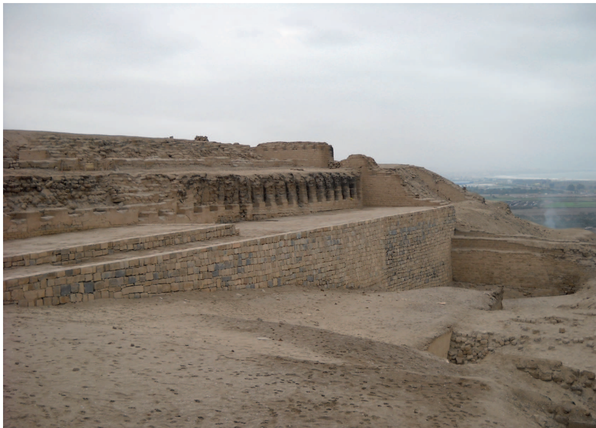
Figure 3. Inca sanctuary of Pachacamac.

corrals, whose shape was irregular, oval or orthogonal. They were constructed of irregular, angular blocks of local rocks without the use of mortar. The height of the walls (Figure 4) oscillates between 0.75 and 1.35 m (on average 1.2 m), while their average thickness measures between 0.6 and 1.1 m (on average 0.76 m). The entrances do not follow any orientation and their width is on average 1.66 m. The diameter of the corrals oscillates between 5 and 40 m. The majority of these structures are situated at the foot of hills or at the bottom of small, dry valleys (Figure 5). Careless stonework, the dimensions, and the fact that neither the corrals nor their entrances follow any strict orientation suggest a purely utilitarian function of corrals, while their location provides proximity to the best pasturelands of the lomas . Near many corrals, small, circular, stone structures were found, whose diameter oscillates between 2-5 m. They probably should be interpreted as remains of temporary, residential structures analogical to those used by contemporary chivateros , whose houses have a lower part made of angular stones and upper parts made of animal skin. Moreover, in Lomas de Iguanil a rock shelter with associated pre-Columbian ceramic was found, which probably also served as a residential structure (Figure 6).