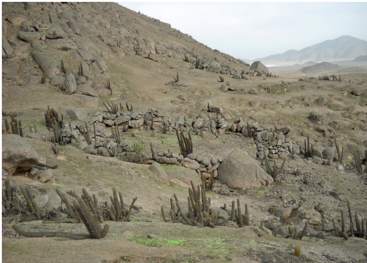
Figure 4. Corrals located at the foot of hills in Lomas de Iguanil.

pastoralists and coastal populations. Some corn cobs were also found on the surface, but due to the lack of stratigraphical evidence, their pre-Columbian origin is uncertain. In some cases (about 40%) of the corrals, chicken bones were also found, which suggests their use by contemporary chivateros . The phenomenon of re-use of pre-Columbian corrals by contemporary transhumant pastoralists are also known from Santa valley (Lynch 1971).