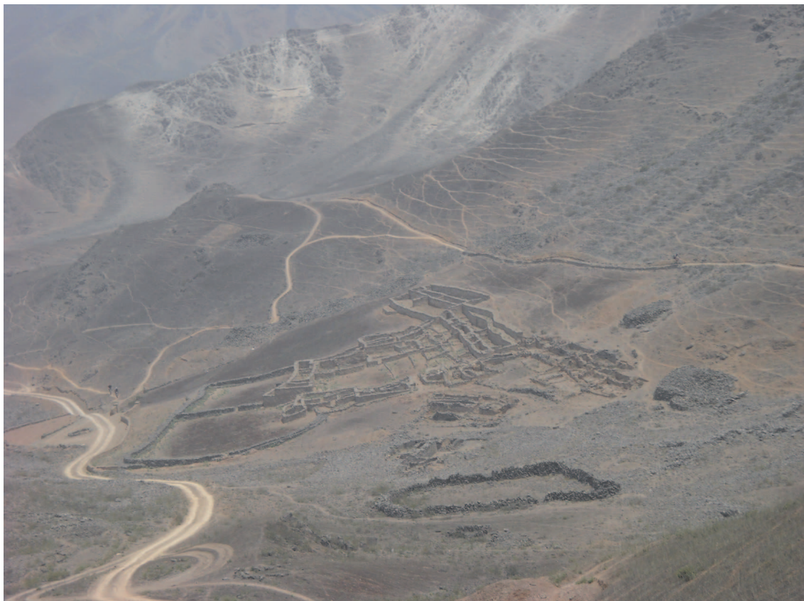
Figure 7. Site of Pueblo Viejo-Pucará.

the area of this study. The abandoned remains of human occupation form fossil cultural landscape, which is the testimony of a Pre-Hispanic cultural development.