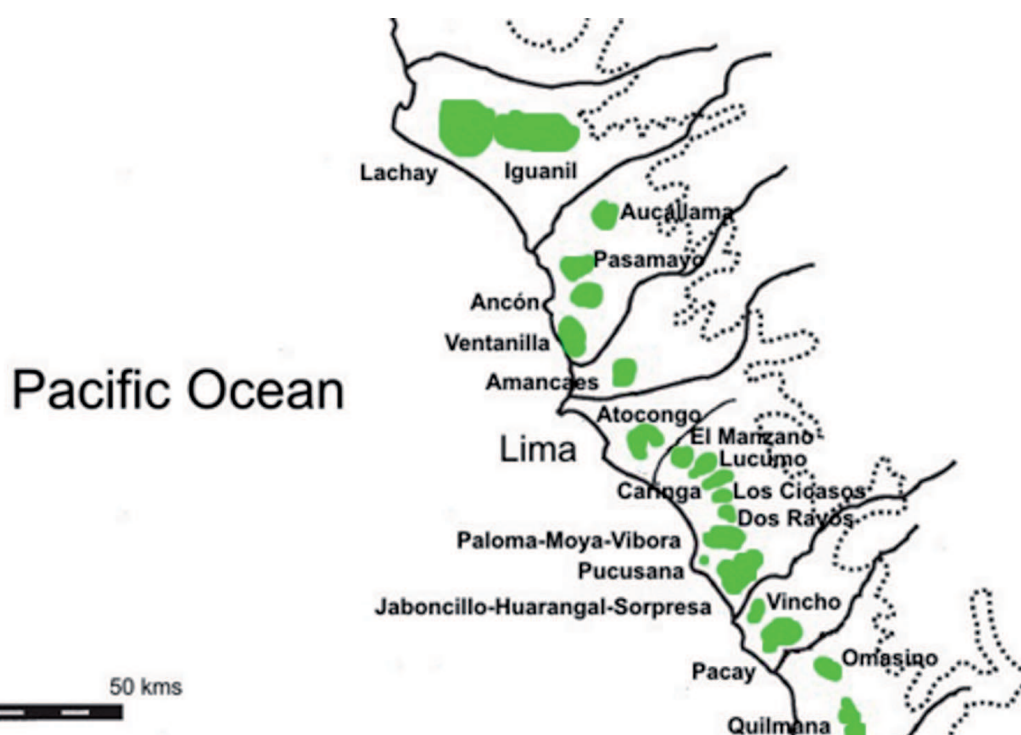
Figure 1. Location of the most important Central Coast lomas .

Due to formal restrictions of the Peruvian cultural heritage protection law (Kalicki 2010) I had to restrict my field investigation to a limited archaeological study in the Lachay-Iguanil zone, during which I was only able to make sketches of the sites and conduct photographic documentation of structures and artifacts found on the ground surface. Therefore, the results presented herein should be considered very preliminary and have to be verified by future excavations and intensive surface prospection. Nevertheless, when considered jointly with previous studies, they suggest that in late