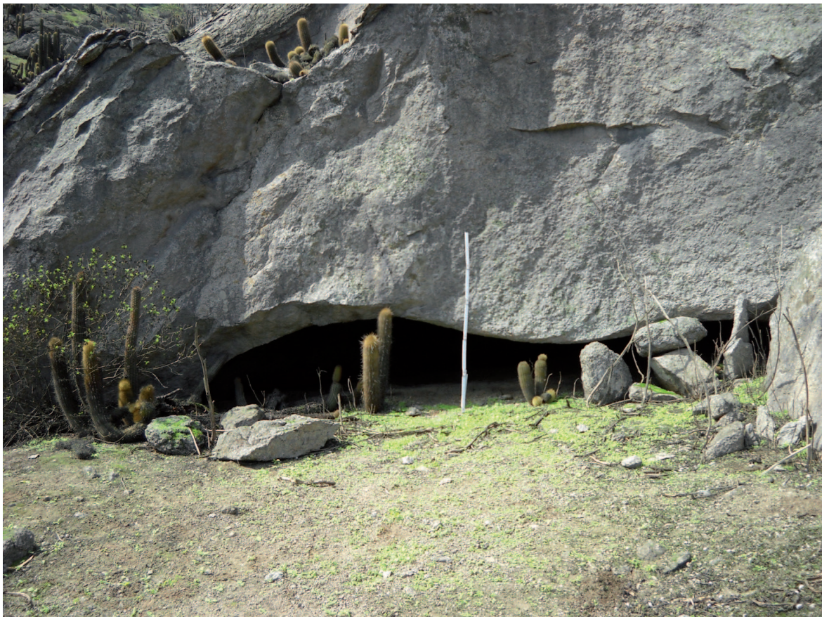
Figure 6. Rock-shelter with associated late pre-Columbian ceramics in the Lomas de Iguani.

(Mujica et al. 1983). Remains of colonial chivateros have been found in PCR XIII in Pachacamac (Eeckhout 2004c).