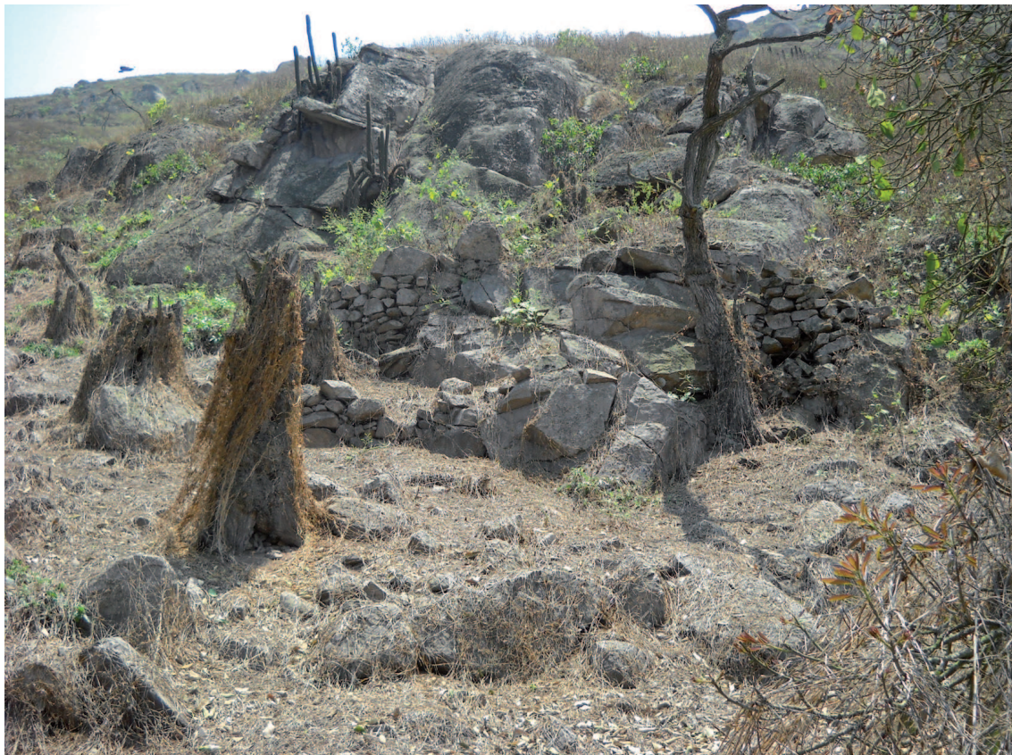
Figure 8. Andenes in the Lomas de Lachay.

Isotopic analysis of bones from Malanche 22 suggests that vegetable products, probably from nearby fields in the lomas predominated in the diet (Baraybar 1999). Documentary sources inform us that maize was cultivated in fog oases (Bernabe de Cobo). Modern ethnographic analogies from Costa Extremo Sur suggest that manioc and sweet potatoes were also cultivated (Engel 1973; Baraybar 1999). In pre-Columbian sites located in fog oases, traces of potatoes, jiquima , olluco, peanuts, lucuma and some fruits (tara, mito) were found (Engel 1973). Other economic activities of coastal groups encompassed hunting (especially white-tailed deer), gathering of wild plants and snails, pasturing of some llamas, tree-cutting and exploiting clay (Engel 1973; Mujica et al. 1983; Vallejo Berrios 2004; Makowski et al. 2008).