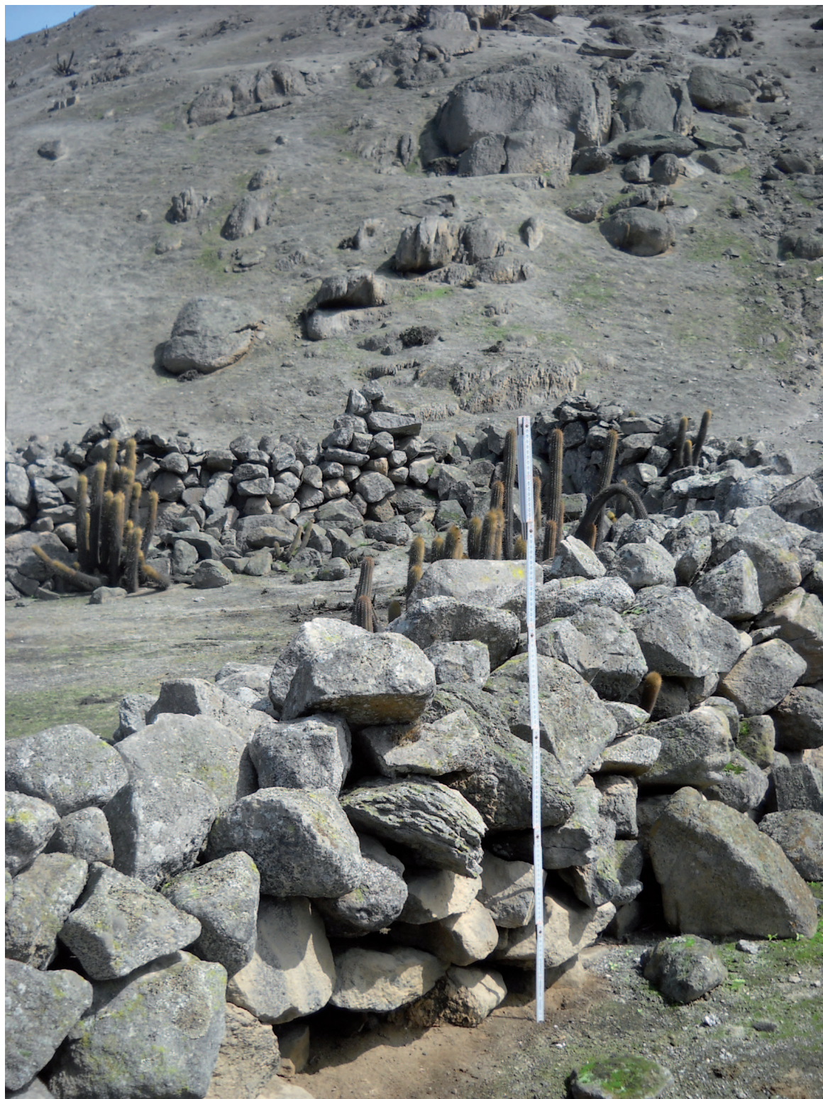
Figure 5. Wall of pre-Columbian corral.